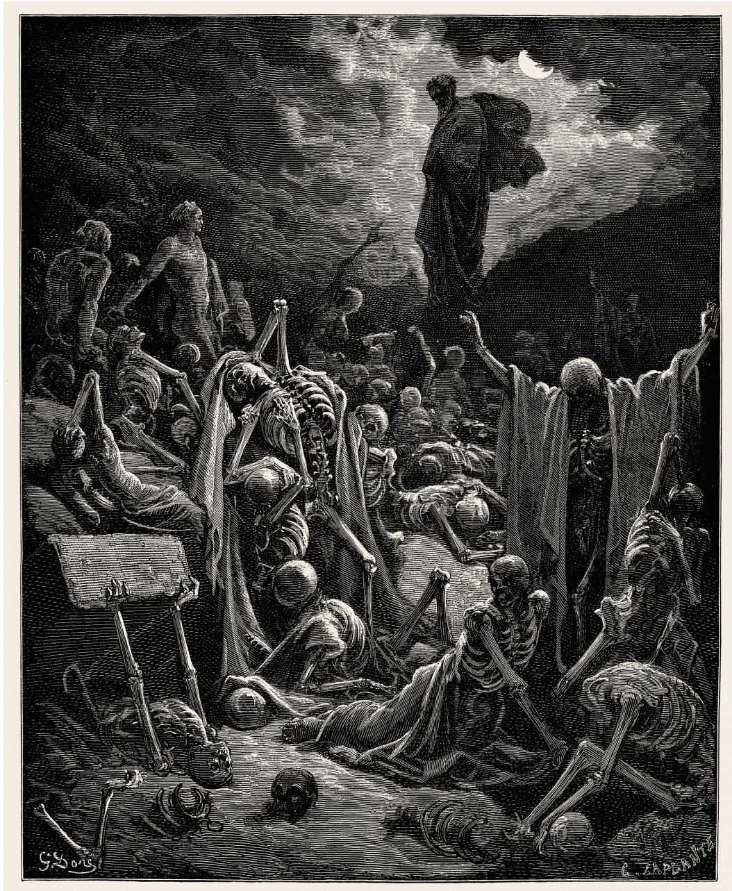
God in the Valley